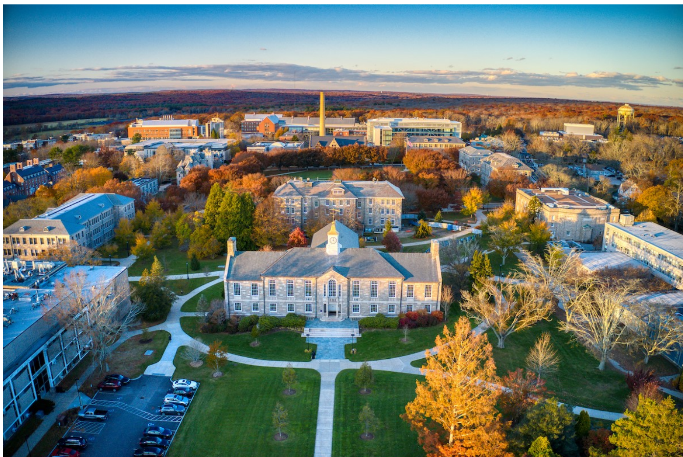
The University of Rhode Island, United States of America

guage Celebration where students got a 'passport' stamped by participating in activities in different languages or about different cultures. We also offered a series of events for Native American Heritage Month, in November, to support not only our local tribes, but all of our indigenous students.